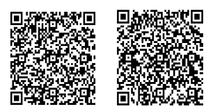
(Airport Shuttle Bus) (Wakayama Prefecture Website) (JAL MaaS)

Contact Us : Meiko bus (+81) 739-42-3378