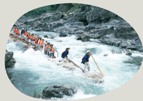
Traditional Log Rafting